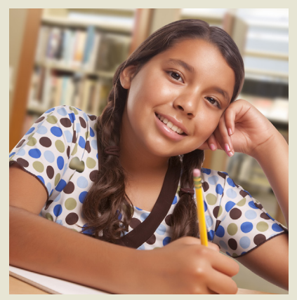
spelling and grammar. Print the articles in a family newsletter.

After your child gathers her information, she is ready to write. Remind her to check